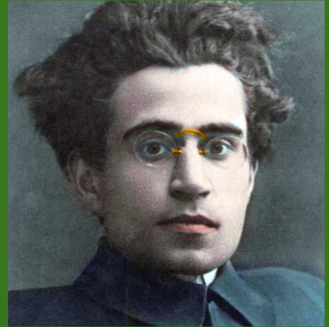
Antonio Gramsci 1891-1937

I am a pessimist because of intelligence, but an optimist because of will